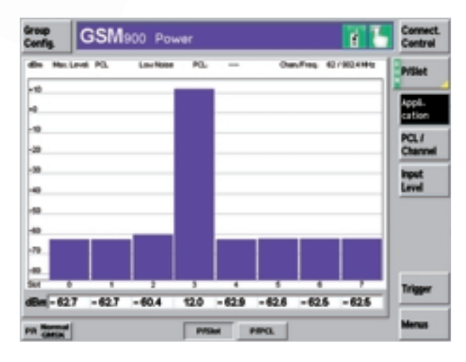
FIG 5 CMU 200 measures power through all PCLs of mobile on three different GSM channels in just two or three seconds

FIG 3 Power versus slot measurement determines power in all eight timeslots of a frame – an interesting function for multislot mobiles